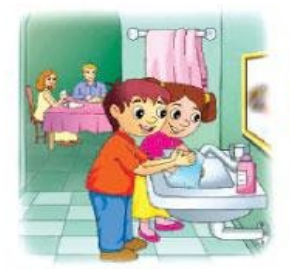
Wash your hands before and after meal.