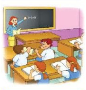
Be attentive in the class room.