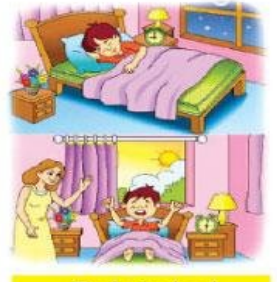
Early to bed, early to rise.