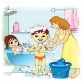
Take bath everyday.