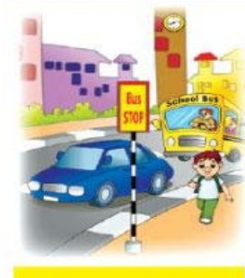
Go to school on time.