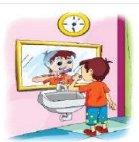
Brush your teeth twice a day.