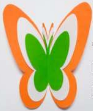
Tricolor Paper Butterfly